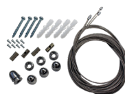
Aircraft Cable Kit

Ready to install into existing T-bars out of the box; or add accessories for additional mounting flexibility