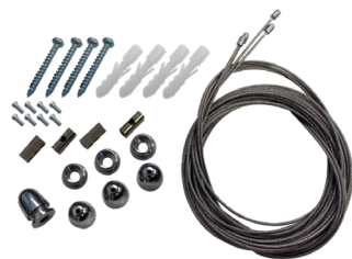
Aircraft Cable Kit

Ready to install into existing T-bars out of the box; or add accessories for additional mounting flexibility