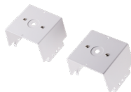
THREADED ROD MOUNT