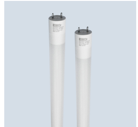
T8 BYPASS/LINE VOLTAGE POLYCARBONATE