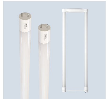
T8 DIRECT FIT