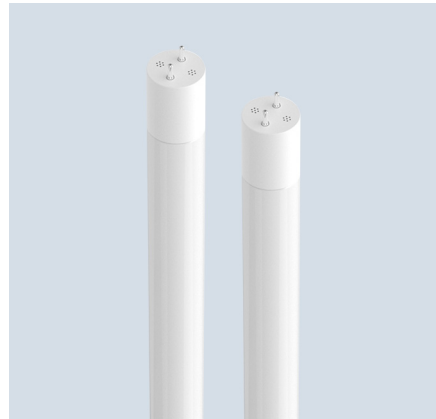
T8 BYPASS/LINE VOLTAGE DOUBLE-ENDED