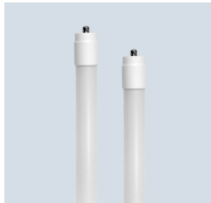
T8 BYPASS/ LINE VOLTAGE 8'