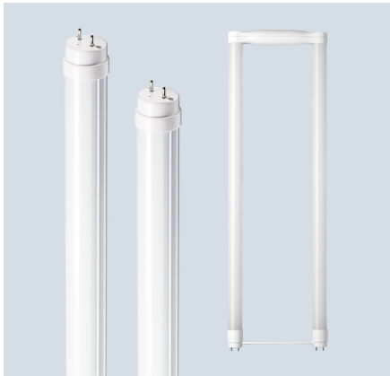
T8 BYPASS/ LINE VOLTAGE