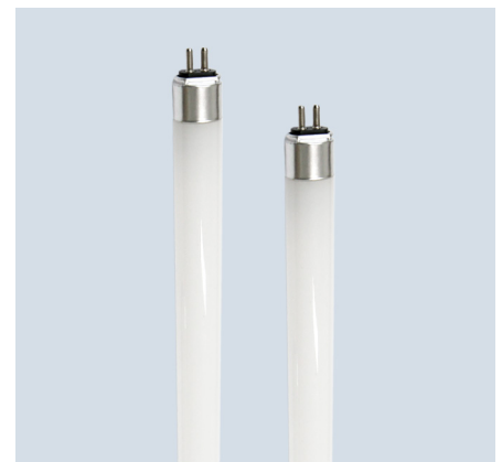
T5 DIRECT FIT