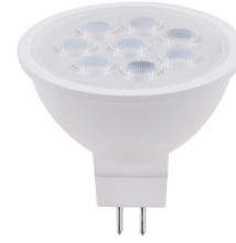
MR16 GU5.3 Base