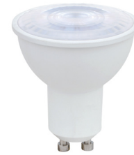
MR16 GU10 Base