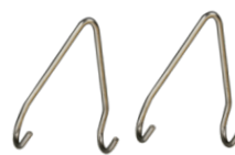
INCLUDED V-HOOKS FOR SUSPENSION INSTALLATIONS