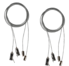
AIRCRAFT CABLE AVAILABLE