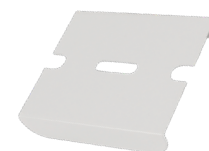
ALIGNMENT PLATE ACCESSORY FOR SURFACE AND SUSPENDED ROW MOUNTING