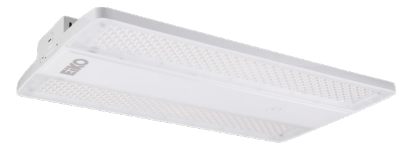
PS400: 400/360/320W 45,000 - 58,300 LM

1.9" profile and up to 27% more compact than competing high bays for faster installation at height.